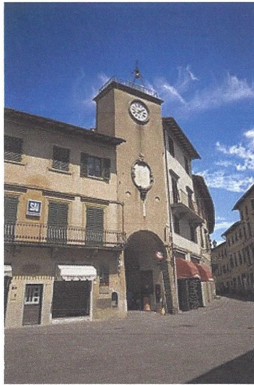
San Casciano, Tuscany, Italy

It, too, alternates between Morgan Hill kids traveling to Mizuho one year and then hosting Mizuho kids the following year. The group is now getting ready